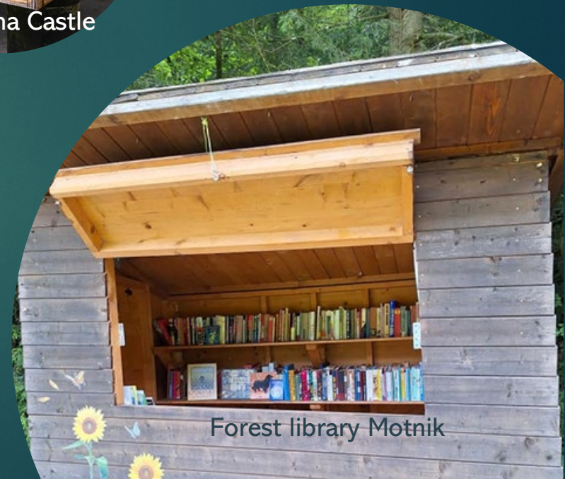
Forest library Motnik